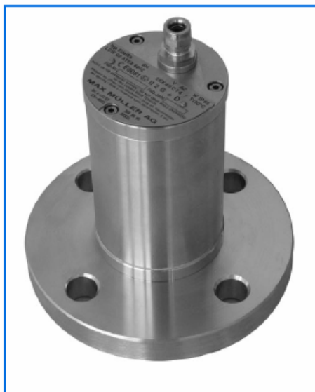
Sightglass light fitting type EdelEx STERI-LINE 20 dH, 24 V, 20 W, EEx d IIC T4, Ex II 2 G + D, on metal fused sightglass flange