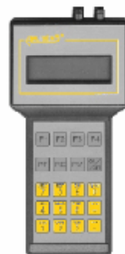
Aplisens KAP-02 communicator